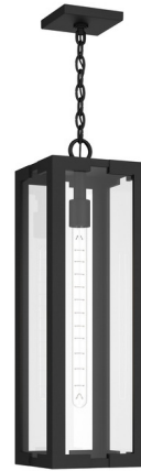
Shown in textured black