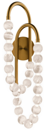
Shown in aged brass / alabaster

LAMP LIFE . . . . . 54000 hours COLOR RENDERING . . . . . 90 CRI LAMP COLOR . . . . . 3000K LUMENS/WATT . . . . . 121.50 LUMINOUS FLUX . . . . . 1373 lumens