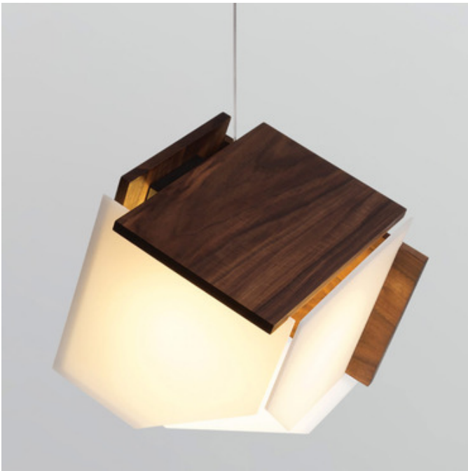
Shown in: Brushed Aluminum / Dark Stained Walnut

The Mica Pendant is a simple cube that has been deconstructed to a sculptural shape that exudes a certain organic symmetry and is a beautiful node creating a sense of space and ambient glow. Available in two sizes with a Walnut or Dark Stained Walnut shade with frosted polymer diffuser complemented by a Brushed Aluminum canopy. 2700K and 3500K color temperature options available. UL and cUL listed. Made in the USA. Prop 65.