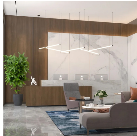
Shown in satin nickel / diffused lens