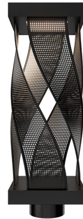
Shown in black / frosted