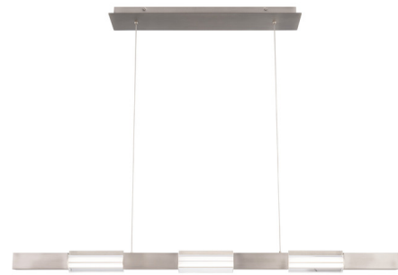
Shown in brushed nickel / clear