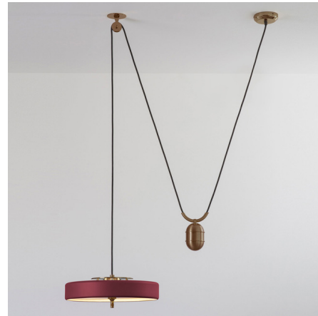
Shown in antique brass / oxblood

COLOR RENDERING . . . . . 80 CRI LAMP COLOR . . . . . 2700K LUMENS/WATT . . . . . 187.50 LUMINOUS FLUX . . . . . 750 lumens