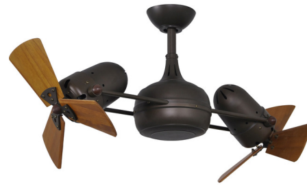
Shown in textured bronze / mahogany tone