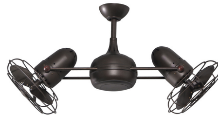
Shown in textured bronze / textured bronze