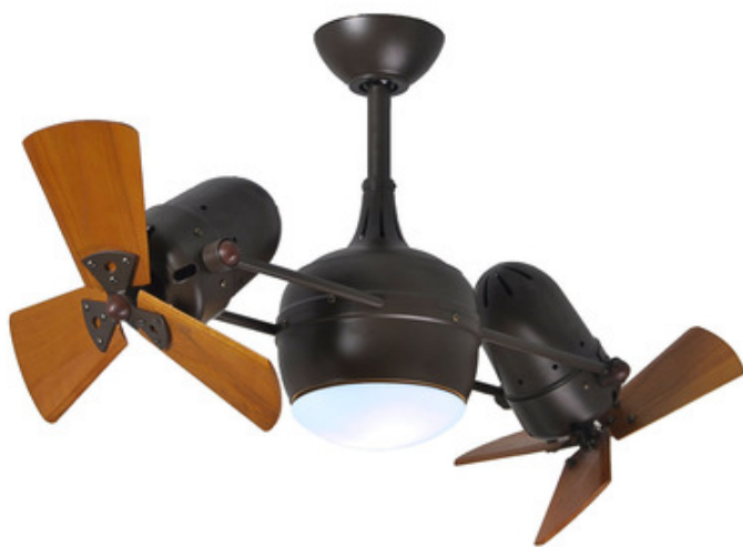
Shown in: Textured Bronze / Mahogany

The Atlas Fan Dagny Wood Ceiling Fan features a retro style double-headed design, combining a body made of cast aluminum and heavy stamped steel with wooden blades that complement the metal housing. It offers smooth, quiet axial rotation, and the fan heads can pivot 180 degrees. Axial rotation can be adjusted by changing fan blade speed and pivoting the heads, achieving optimal air movement. A hand-held RF remote control is included and enables fan on/off, 3 speeds, and forward and reverse. If the fan has a light, the control turns the light on/off and dims it. Optional accessories are sold separately. Note: The Brushed Nickel finish is only available for fans that have a light.