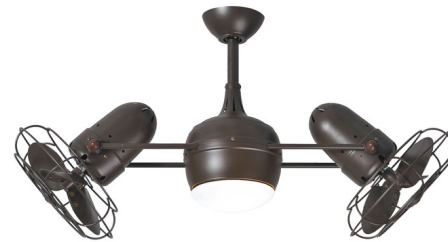
Shown in textured bronze / textured bronze