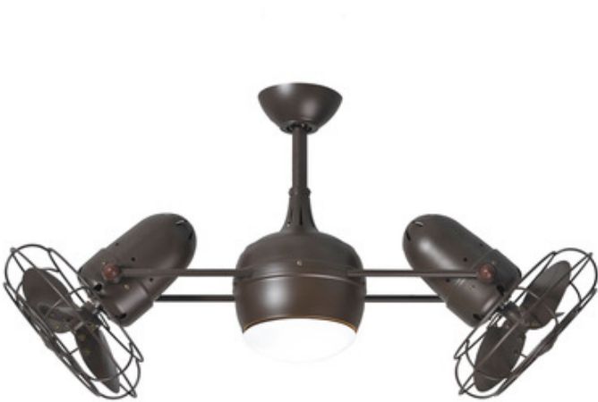
Shown in: Textured Bronze / Textured Bronze

The Atlas Fan Dagny Metal Ceiling Fan features a retro design with straight parallel arms supporting two heads. It offers smooth, quiet axial rotation, and the fan heads pivot 180 degrees. Pivoting the heads or changing fan blade speed changes the axial rotation to achieve optimal air movement. The body is made of cast aluminum and heavy stamped steel, and the blades, also constructed of metal, are encased in decorative cages of a vintage industrial style. A hand-held RF remote control is included and enables fan on/off, 3 speeds, and forward and reverse. If the fan has a light, the control turns the light on/off and dims it. Optional accessories are sold separately. Note: The Brushed Nickel finish is only available for fans that have a light.