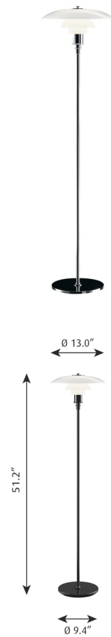
Shown in chrome / white opal