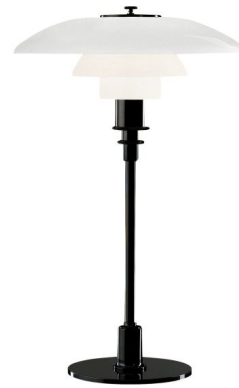
Shown in black chrome / opal

The PH 3/2 Table Lamp, designed by Poul Henningsen, is based on the principle of a reflective three shade system, which directs the majority of the light downwards. The shades are made of hand-blown opal three layer glass, which is glossy on top and sandblasted matte on the underside, giving a soft light distribution. On/Off switch on cord.