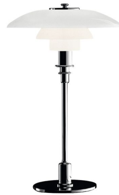
Shown in chrome / opal