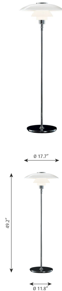
Shown in chrome / opal