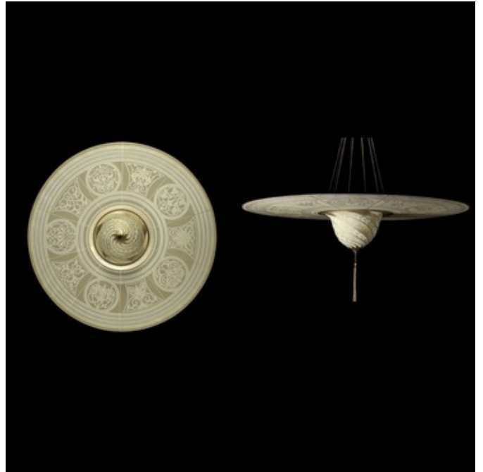
Shown in: Brass / Deco Silk

The Samarkanda Suspension features an Ivory silk shade and disk with a Brass finish and a dark brown canopy. Available with Deco-patterned, Serpentine-patterned, or plain silk. Handmade in Italy.