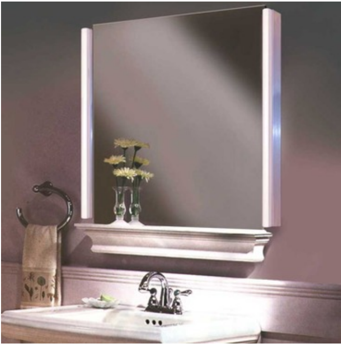
Shown in: Satin Chrome