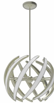
Shown in satin nickel / frosted

Swirl Pendant features softly curved sculptural arms made of stamped and fabricated steel and aluminum construction with a Bright Satin Nickel finish. Highly efficient, replaceable flexible LED strips with modular connectors are mounted inside metal stampings which dissipate heat. The curved, lyrical shapes send light in all directions. Includes three 12 inch and one 6 inch downrods. Hang straight swivel (included) attaches to top of stem. Additional 24 inch stems sold separately. Universal driver with TRIAC/ELV/0-10V dimming.