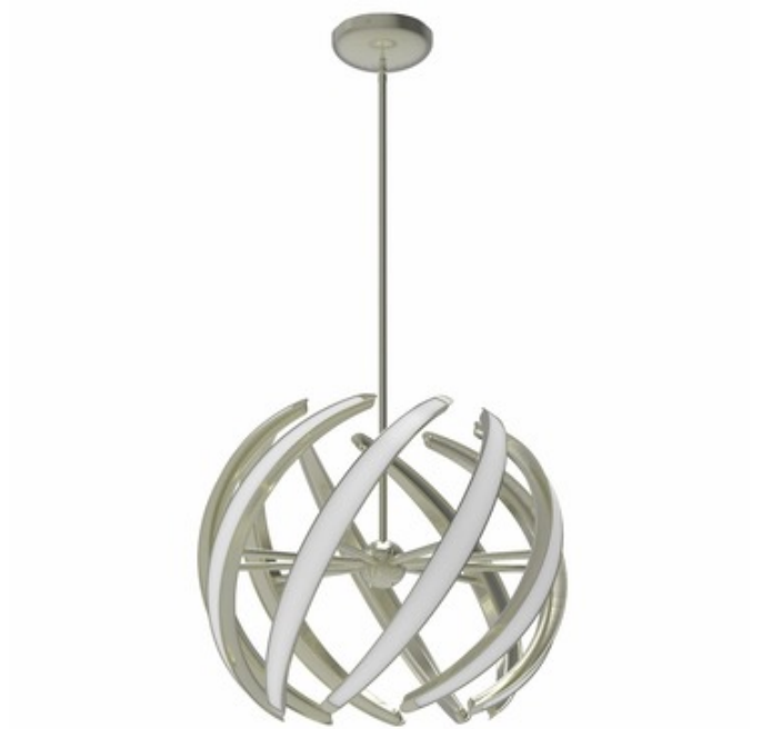
Shown in: Satin Nickel / Frosted

Swirl Pendant features softly curved sculptural arms made of stamped and fabricated steel and aluminum construction with a Bright Satin Nickel finish. Highly efficient, replaceable flexible LED strips with modular connectors are mounted inside metal stampings which dissipate heat. The curved, lyrical shapes send light in all directions. Includes three 12 inch and one 6 inch downrods. Hang straight swivel (included) attaches to top of stem. Additional 24 inch stems sold separately. Universal driver with TRIAC/ELV/0-10V dimming.