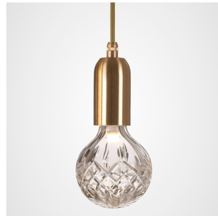
Shown in brass / clear

PRODUCT DIMENSIONS . . . . . Cable Length: 72" LAMP COLOR . . . . . 2700K LUMENS/WATT . . . . . 45.00 LUMINOUS FLUX . . . . . 90 lumens