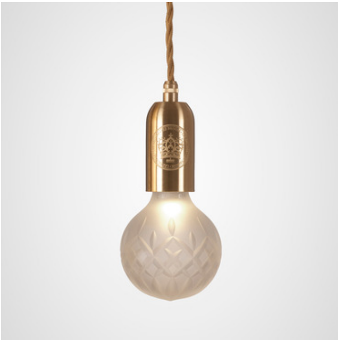
Shown in: Brass / Frosted

Crystal Frost Bulb Pendant is available in a Brass finish with a frost lamp. Also available as a chandelier or bulb. The Brushed Brass pendant fitting, engraved with the Lee Broom logo, creates a clean and simple outline with the Crystal Frost Bulb. Each pendant fitting comes with matching Gold fabric cable and a Brushed Brass ceiling rose. Taking inspiration from the delicate craftsmanship of crystal cutting, Crystal Frost Bulb combines industrial influences with decorative qualities, transforming the everyday light bulb into a beautiful ornamental light fitting. Each lead bulb is handcrafted using traditional techniques and hand cut with a classic crystal pattern inspired by those found on traditional whiskey glasses and decanters.