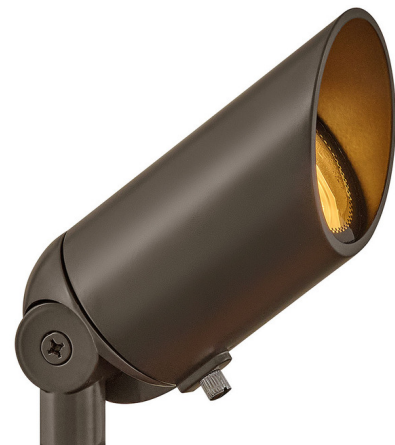
Shown in bronze / clear

Hinkley's 12V Hardy Island MR16 Spot Light is constructed of heavy duty solid brass designed for harsh environments. Accessories included: Wiring Kit and Ground Spike. Note: Required low voltage magnetic power supply and optional accessories sold separately.