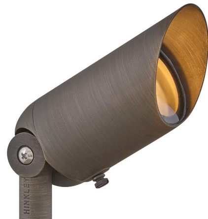
Shown in matte bronze / clear

Hinkley's 12V Hardy Island MR16 Spot Light is constructed of heavy duty solid brass designed for harsh environments. Accessories included: Wiring Kit and Ground Spike. Note: Required low voltage magnetic power supply and optional accessories sold separately.