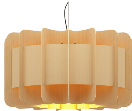
Shown in black / ash / ash

The Clarissa Pendant brings a bold decorative look to your interior space. The handcrafted wood veneer body is fused with a malleable central panel that adds strength to this piece of art. Bruck's WEP (Wood Ecological Project) collection specializes in sustainable, natural wood luminaires. Every made to order fixture's unique character is nothing short of art. WEPlight solutions help cultivate a serene environment in any space. Designed, handcrafted, and painted by master artisans with reconstructed real wood veneer from Spain and assembled in the USA. Note: Beech / Beech is only available in 16.5 inch size.