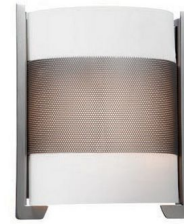
Shown in brushed steel / opal

Iron Wall Light features Opal glass surrounded by textured metal mesh with a Brushed Steel or Bronze finish. Available with Incandescent or LED lamping. Incandescent is dimmable with a standard incandescent dimmer, sold separately. LED is dimmable with an electronic low voltage dimmer (recommended Lutron Diva DVELV-300P or Lutron Skylark SELF-300P), sold separately. UL and cUL listed. ADA compliant. Suitable for commercial or residential use.