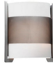
Shown in brushed steel / opal

Iron Wall Light features Opal glass surrounded by textured metal mesh with a Brushed Steel or Bronze finish. Available with Incandescent or LED lamping. Incandescent is dimmable with a standard incandescent dimmer, sold separately. LED is dimmable with an electronic low voltage dimmer (recommended Lutron Diva DVELV-300P or Lutron Skylark SELF-300P), sold separately. UL and cUL listed. ADA compliant. Suitable for commercial or residential use.