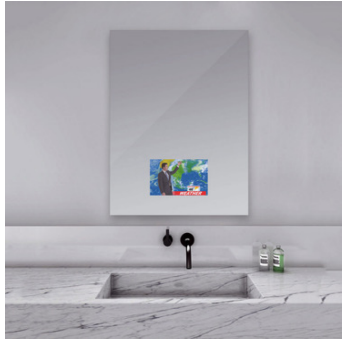
Shown in: Mirror

The Loft Mirror with 15 inch TV features a corrosion resistant OmegaMirror glass. Choice of a 21.5 or 15.6 inch LED HDTV with HDMI, RF and component connections. Integrated speakers for high quality stereo sound. Electric Mirror's Spectrum Mirror TVs are best suited for bathrooms that are not overly bright. When the TV is off, the screen area is camouflaged, leaving only a light gray image where the TV is located. Waterproof remote included. Available in four sizes. Note: The Loft TV mirror must be installed in the W x H (width x height) orientation as listed; it cannot be installed in any other direction.