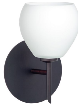
Shown in bronze / opal matte

The Tay Tay Wall Light features assorted glass options with a Bronze or Satin Nickel finish. Can be mounted as an uplight or a downlight. 40 watt, 120 volt JCD G9 base bulbs are required but not included. 5 inch width x 7.75 inch height x 5.5 inch depth. UL listed. Suitable for interior damp locations.