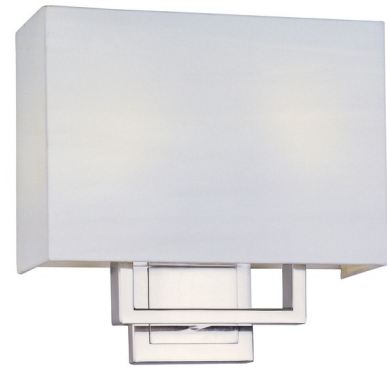
Shown in satin nickel / white

Edinburg Square LED Wall Sconce is available in a Satin Nickel finish with a White shade. NOTE: This is a discontinued floor model and limited to quantity on hand.