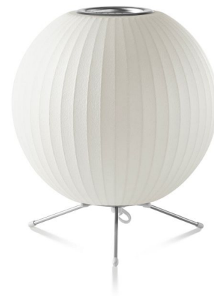
Shown in brushed nickel / white

Nelson Bubble Lamps designed by George Nelson produced by Herman Miller. The George Nelson Bubble Lamp Ball Table Lamp with tripod base is a modern classic solidly constructed in steel available in Brushed Nickel finish. Shade is constructed of a taut White plastic coating a steel wire frame. Lamp is equipped with 90 inches of cord and an easy to use on/off floor switch. Requires one 120 volt medium base incandescent lamp up to 150 watts, not included. UL listed. Made in USA. Dimensions: 12.75 inch diameter x 14 inch height.