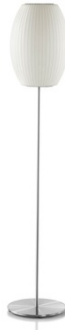
Shown in: Brushed Nickel / White

Nelson Bubble Lamps designed by George Nelson produced by Herman Miller. The George Nelson Bubble Lamp Cigar Lotus Floor Lamp is a modern classic solidly constructed in steel available in Brushed Nickel with a Brushed Nickel base or Brushed Nickel with a Walnut base. Available in three sizes. Each lamp is built with a 6.5 pound, 10 inch round steel base and an easy to use on/off floor switch. Shade is constructed of a taut White plastic coating a steel wire frame.