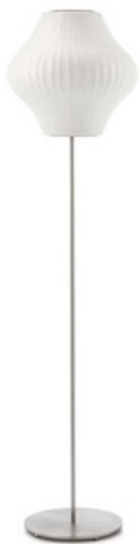
Shown in: Brushed Nickel / White

The George Nelson Bubble Lamp Pear Lotus Floor Lamp is a modern classic solidly constructed in steel available in Brushed Nickel with a Brushed Nickel base or Brushed Nickel with a Walnut base. Available in two sizes. Each lamp is built with a 6.5 pound 10 inch round steel base, 108 inches of cord, and an easy to use on/off floor switch. Shade is constructed of a taut White plastic coating a steel wire frame. Requires one 120 volt medium base incandescent lamp up to 150 watts, not included. UL listed. Made in USA. Dimensions: Small: 13 inch diameter x 12.5 inch high shade x 52.5 inch overall height. Medium: 17 inch diameter x 19 inch high shade x 57.5 inch overall height.