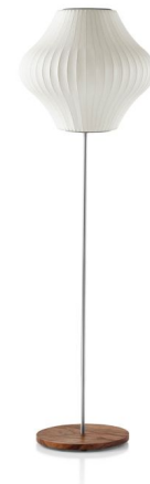
Shown in brushed nickel / walnut base / white

Nelson Bubble Lamps designed by George Nelson produced by Herman Miller. The George Nelson Bubble Lamp Pear Lotus Floor Lamp is a modern classic solidly constructed in steel available in Brushed Nickel with a Brushed Nickel base or Brushed Nickel with a Walnut base. Available in two sizes. Each lamp is built with a 6.5 pound 10 inch round steel base, 108 inches of cord, and an easy to use on/off floor switch. Shade is constructed of a taut White plastic coating a steel wire frame.