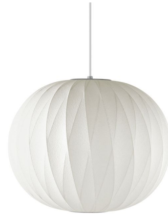
Shown in brushed nickel / white

Nelson Bubble Lamps designed by George Nelson produced by Herman Miller. The Nelson® Ball CrissCross® Bubble Pendant features a shade made from a taut White plastic coating over a steel wire frame with canopy and accent finish in Brushed Nickel. Available in two sizes.