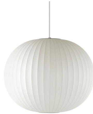
Shown in brushed nickel / white

Nelson Bubble Lamps designed by George Nelson produced by Herman Miller. The George Nelson Bubble Lamp Ball Pendant features a shade made from a taut White plastic coating over a steel wire frame with canopy and accent finish in Brushed Nickel.