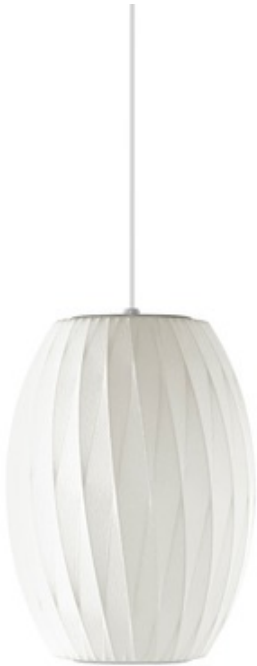
Shown in: Brushed Nickel / White

Nelson Bubble Lamps designed by George Nelson produced by Herman Miller. The Nelson® Cigar® CrissCross® Bubble Pendant was designed as one of the first bubble lamps in 1947. Shade is made from a taut White plastic coating over a steel wire frame with canopy and accent finish in Brushed Nickel.