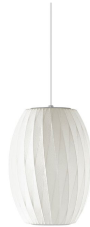
Shown in brushed nickel / white

Nelson Bubble Lamps designed by George Nelson produced by Herman Miller. The Nelson® Cigar® CrissCross® Bubble Pendant was designed as one of the first bubble lamps in 1947. Shade is made from a taut White plastic coating over a steel wire frame with canopy and accent finish in Brushed Nickel.