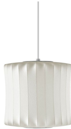
Shown in brushed nickel / white

Nelson Bubble Lamps designed by George Nelson produced by Herman Miller. The Nelson® Lantern Bubble Pendant features a shade made from a taut White plastic coating over a steel wire frame with canopy and accent finish in Brushed Nickel.