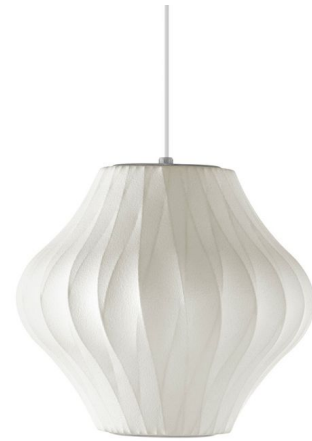
Shown in brushed nickel / white

Nelson Bubble Lamps designed by George Nelson produced by Herman Miller. The Nelson® Pear® CrissCross® Bubble Pendant features a shade made from a taut White plastic coating over a steel wire frame with canopy and accent finish in Brushed Nickel.