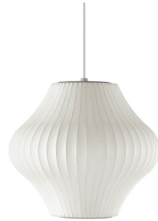
Shown in brushed nickel / white

Nelson Bubble Lamps designed by George Nelson produced by Herman Miller. The Nelson® Pear® Bubble Pendant features a shade made from a taut White plastic coating over a steel wire frame with canopy and accent finish in Brushed Nickel.