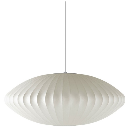
Shown in brushed nickel / white

Nelson Bubble Lamps designed by George Nelson produced by Herman Miller. The George Nelson Bubble Lamp Saucer Pendant was designed as one of the first bubble lamps in 1947. Shade is made from a taut White plastic coating over a steel wire frame with canopy and accent finish in Brushed Nickel.