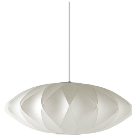
Shown in brushed nickel / white

Nelson Bubble Lamps designed by George Nelson produced by Herman Miller. The George Nelson Bubble Lamp Saucer® CrissCross® Pendant was designed as one of the first bubble lamps in 1947. Shade is made from a taut White plastic coating over a steel wire frame with canopy and accent finish in Brushed Nickel.