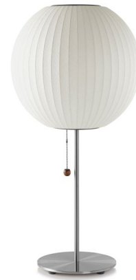
Shown in brushed nickel / white

Nelson Bubble Lamps designed by George Nelson produced by Herman Miller. The George Nelson Bubble Lamp Ball Lotus Table Lamp is a modern classic solidly constructed of steel available in Brushed Nickel with a Brushed Nickel base or Brushed Nickel with a Walnut base. Shade is constructed of a taut White plastic coating over a steel wire frame.