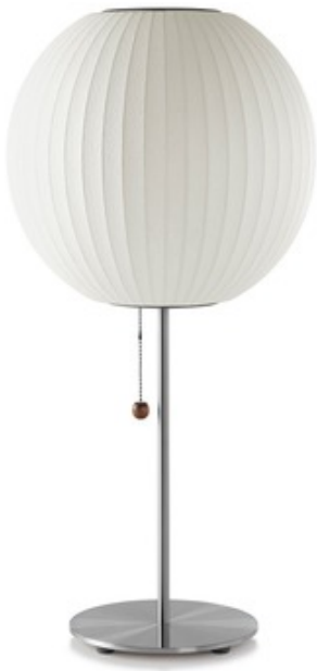
Shown in: Brushed Nickel / White

Nelson Bubble Lamps designed by George Nelson produced by Herman Miller. The George Nelson Bubble Lamp Ball Lotus Table Lamp is a modern classic solidly constructed of steel available in Brushed Nickel with a Brushed Nickel base or Brushed Nickel with a Walnut base. Shade is constructed of a taut White plastic coating over a steel wire frame.