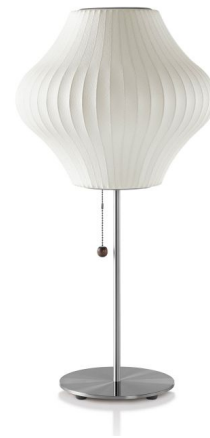
Shown in brushed nickel / white

Nelson Bubble Lamps designed by George Nelson produced by Herman Miller. The George Nelson Bubble Lamp Pear® Lotus Table Lamp is a modern classic solidly constructed of steel available in Brushed Nickel with a Brushed Nickel base or Brushed Nickel with a Walnut base. Shade is constructed of a taut White plastic coating over a steel wire frame. Lamp is built with an 8 inch steel base, 86 inches of cord, and an easy to use on/off pull chain with a solid walnut ball end cap.