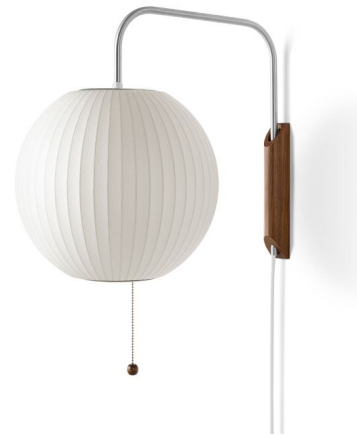
Shown in brushed nickel / walnut / white

Nelson Bubble Lamps designed by George Nelson produced by Herman Miller. The George Nelson Bubble Lamp Ball Wall Sconce is constructed with a 2 inch thick solid walnut wall mount and a Brushed Nickel steel arm. Shade is a taut White plastic coating over a steel wire frame. The arm has a swivel hinge and an adjustable 12-foot plug-in cord with a counterweight that allows for height adjustments. This clever design allows one to adjust the sconce from left-to-right, and up-and-down, without having to change its position on the wall.