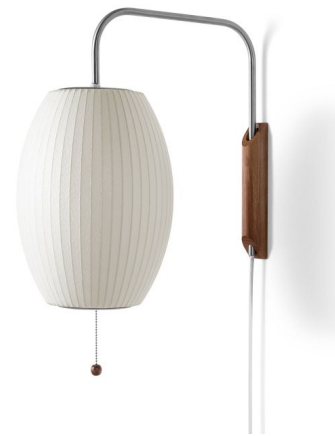
Shown in brushed nickel / walnut / white

Nelson Bubble Lamps designed by George Nelson produced by Herman Miller. The George Nelson Bubble Lamp Cigar Wall Sconce is constructed with a 2 inch thick solid walnut wall mount and a Brushed Nickel steel arm. Shade is a taut White plastic coating over a steel wire frame. The arm has a swivel hinge and an adjustable 12-foot plug-in cord with a counterweight that allows for height adjustments. This clever design allows one to adjust the sconce from left-to-right and up-and-down without having to change its position on the wall.