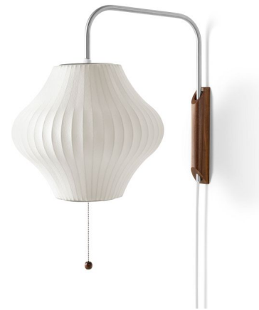
Shown in brushed nickel / walnut / white

Nelson Bubble Lamps designed by George Nelson produced by Herman Miller. The George Nelson Bubble Lamp Pear® Wall Sconce is constructed with a 2 inch thick solid walnut wall mount and a Brushed Nickel steel arm. Shade is a taut White plastic coating over a steel wire frame. The arm has a swivel hinge and an adjustable 12-foot plug-in cord with a counterweight that allows for height adjustments. This clever design allows one to adjust the sconce from left-to-right, and up-and-down, without having to change its position on the wall.