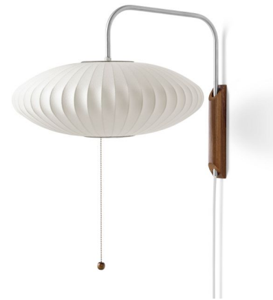
Shown in brushed nickel / walnut / white

Nelson Bubble Lamps designed by George Nelson produced by Herman Miller. The George Nelson Bubble Lamp Saucer® Wall Sconce is constructed with a 2 inch thick solid walnut wall mount and a Brushed Nickel steel arm. Shade is a taut White plastic coating over a steel wire frame. The arm has a swivel hinge and an adjustable 12 foot plug in cord with a counterweight that allows for height adjustments. This clever design allows one to adjust the sconce from left-to-right, and up-and-down, without having to change its position on the wall.