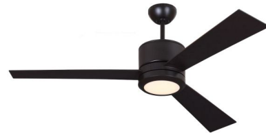
Shown in oil rubbed bronze / matte white