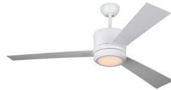
Shown in matte white / matte white / matte white

COLOR RENDERING . . . . . 90 CRI LAMP COLOR . . . . . 2700K LUMENS/WATT . . . . . 45.00 LUMINOUS FLUX . . . . . 900 lumens