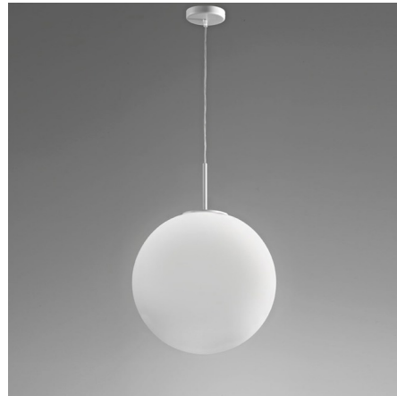
Shown in chrome / opal

The Sferis Pendant is a classic globe of blown triplex Opal glass with a Chrome or White finish. Triplex glass, a specialty of Ai Lati, is a three-ply cased Opal glass made up of a thin white layer that is inside two layers of clear glass. This helps optimize the lumen output and creates a uniform light. The Sferis Pendant provides direct diffused ambient illumination. Available in four sizes. UL listed. Made in Italy.