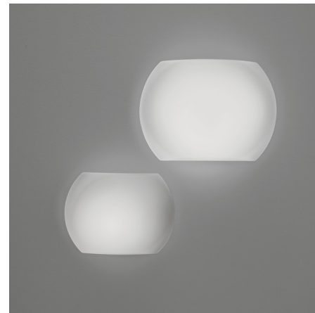
Shown in white / opal

The Chiusa Wall / Ceiling Light provides evenly diffused ambient and general illumination. Features blown triplex Opal glass with a White finish. Available in two sizes and two lamping options. Triplex glass, a specialty of Ai Lati, is a three-ply cased opal glass, made up of a thin white layer that is inside two layers of clear glass. This helps optimize the lumen output and creates a uniform light. LED option is not dimmable. . Made in Italy.