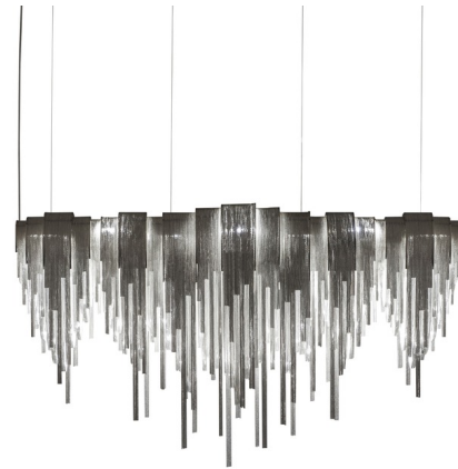
Shown in nickel